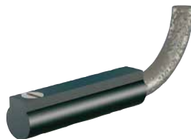
Long Barrel 4mm Straight Sensor