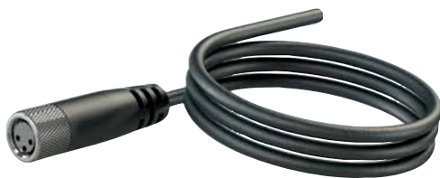
Cable Straight, Quick Disconnect, Socket, 3 Conductor, 2M Length